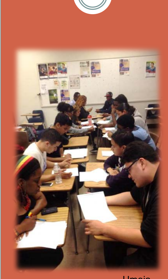
Umoja San Diego City College